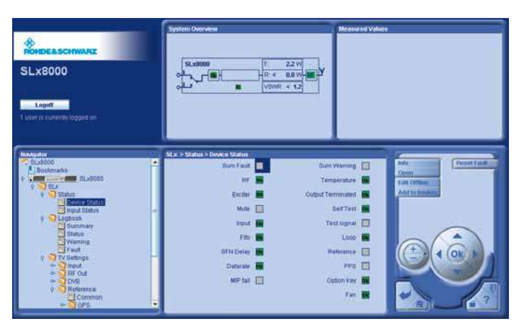
Convenient operation of the R&S<sup>®</sup>SLx8000 family of UHF/VHF transmitters via a web browser.

The output stages in the transmitters for digital standards are precorrected for all specified frequencies and power levels. After a change in frequency or power, the automatic set&go function loads the corresponding precorrection curve in the background. Manual precorrection is therefore not necessary when a transmitter is put into operation or a when a channel is changed. The available precorrection curves make it possible to reduce the power by as much as 10 dB below the rated power throughout the entire frequency range.